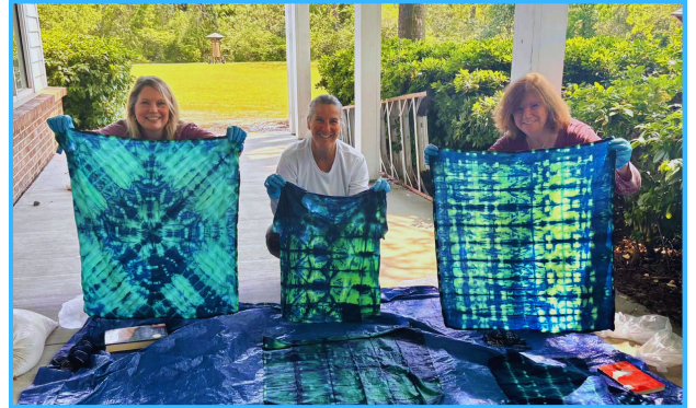
Creativity bloomed at our Indigo Dye Workshop as members experimented with natural indigo and beautiful pattern-making at LSC.