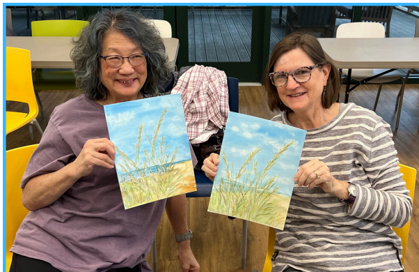
Wonderful pieces painted in Watercolor Workshop. Flowers & Turtles will be painted in May & June.

Wed, May 6-27, 10 am-12 pm register here