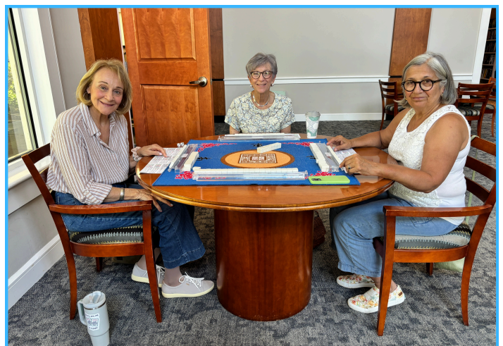
Mah jongg, laughter, and great company at LSC.

Register online or by calling Waring Senior Center at (843) 402-1990 or Lowcountry Senior Center at (843) 990-5555.