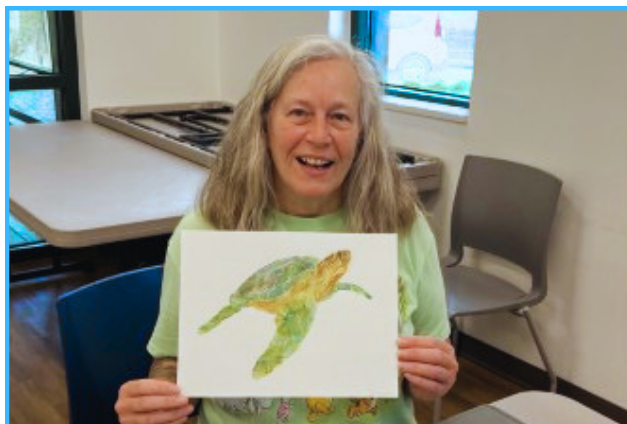
Terrific work from the Sea Turtle Watercolor Workshop at WSC. This class will be offered again at LSC on Tues, Jun 23, 1-3 pm. More info on pg. 17.