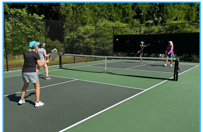
Pickleball players enjoying the warmer temps at WSC.

We continue to meet with potential contractors and waiting on our permit from City of Charleston. Although it's slow, there is progress. We are looking forward to breaking ground on our three outdoor pickleball courts and know that the wait will be well worth it!