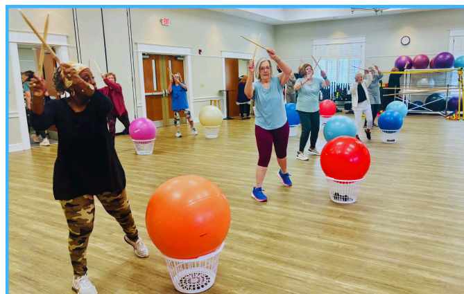
Members moving with the beat in Drum Beat Fusion at LSC.

Register online or by calling Waring Senior Center at (843) 402-1990 or Lowcountry Senior Center at (843) 990-5555.