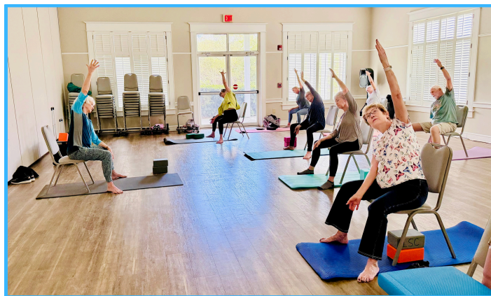
Gentle movements in Mat/Chair Yoga class at LSC.

Mon, Jun 8-Jul 13, 4:45-5:45 pm register here