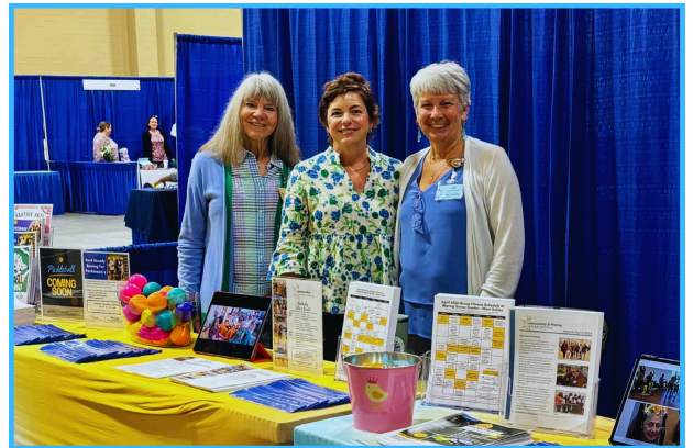
A great day connecting with the community! Thanks to our amazing team at the MUSC Senior Expo.