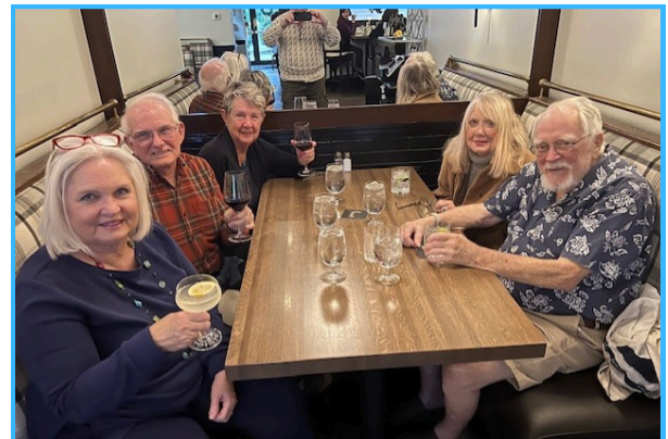
Members enjoying a night out at The James.