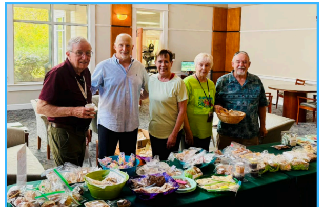
Friends of the Lowcountry Senior Center hard at work and having fun at the bake sale fundraiser at LSC.